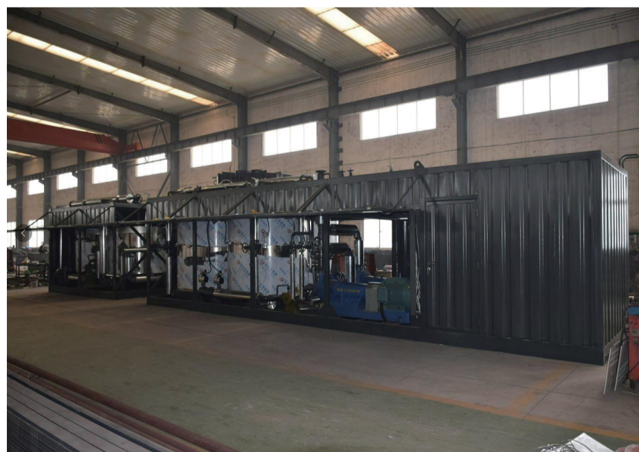
Polymer Modified Bitumen Plant in Australia Three hundred tons of modified asphalt were treated in Melbourne, Australia. September 13th, 2019