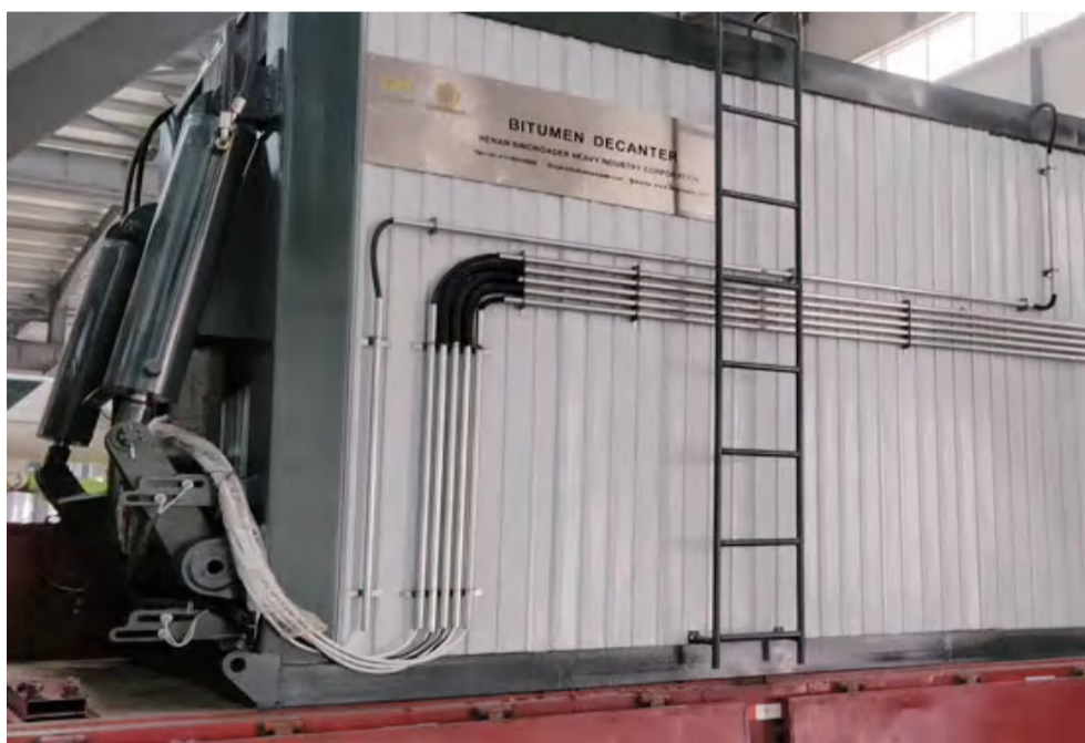
Hydraulic Drummed Bitumen Decanter in Philippines Cebu in the Philippines treated 300 tons of bitumen in bags June 07th, 2019