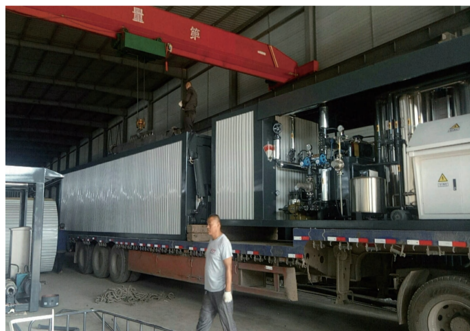
Bitumen Emulsion Plant in Africa Cairo, Africa, treated 300 tons of asphalt to build roads April 21th, 2019