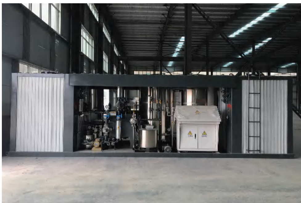
Bitumen Emulsion Plant in Ethiopia Addis ababa, Ethiopia, treated 200 tons of asphalt for road construction November 27th, 2019