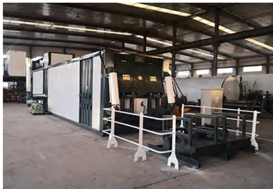
Bitumen Melting Machine/Bitumen Decanter in Nigeria Lagos, Nigeria, handles 800 barrels of asphalt January 03th, 2020