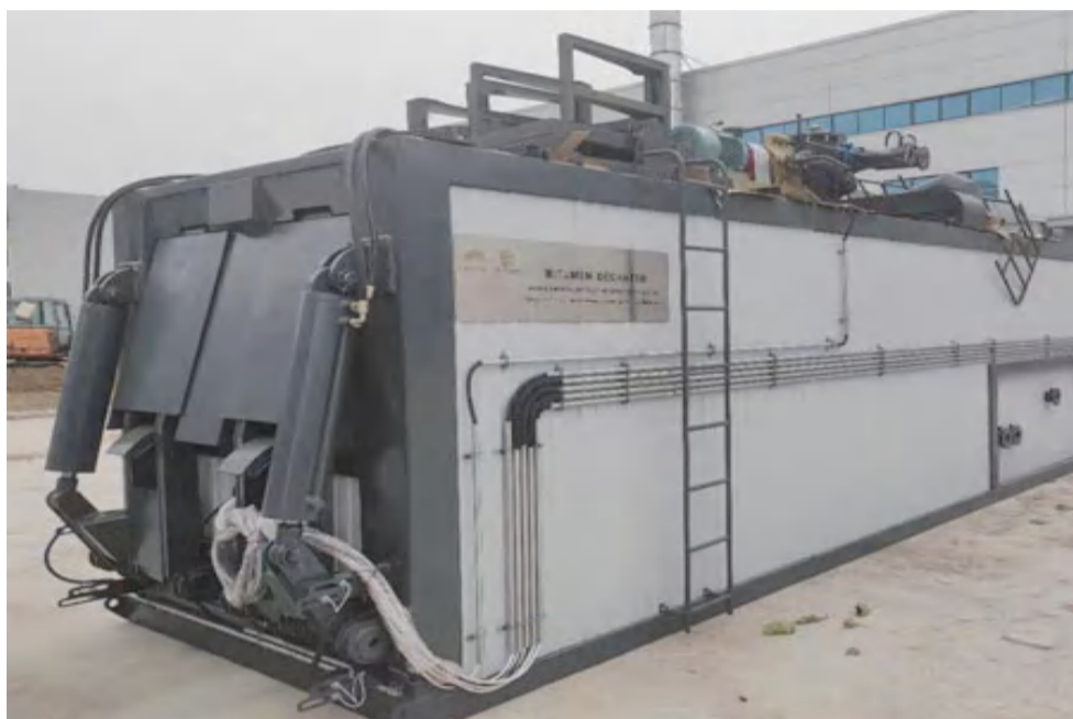
Hydraulic Drummed Bitumen Decanter in Uzbekistan Tashkent, Uzbekistan, handles 300 tons of bitumen in bags January 21th, 2020