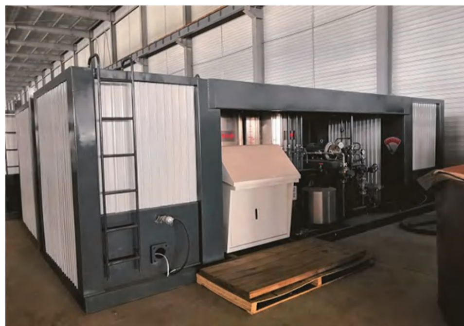
Bitumen Emulsion Plant in Peru Cusco, Peru, treated 200 tons of asphalt to build roads July 18th, 2019