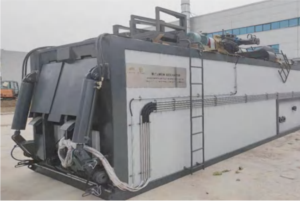
Hydraulic Drummed Bitumen Decanter in Uzbekistan Tashkent, Uzbekistan, handles 300 tons of bitumen in bags January 21th, 2020