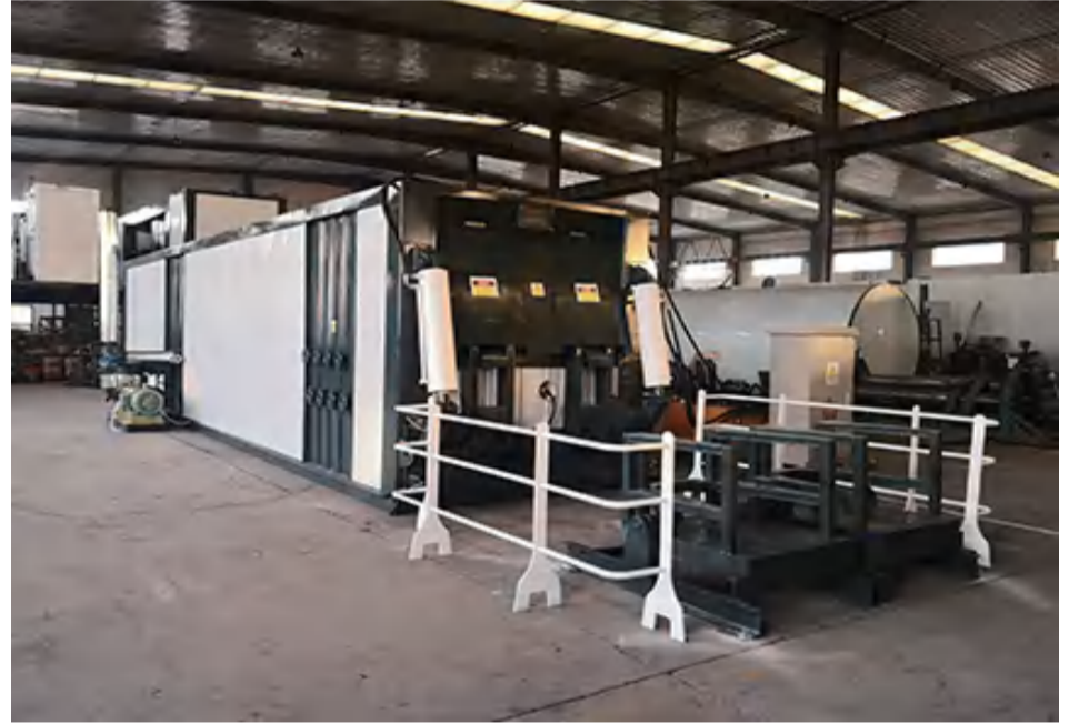
Bitumen Melting Machine/Bitumen Decanter in Nigeria Lagos, Nigeria, handles 800 barrels of asphalt January 03th, 2020